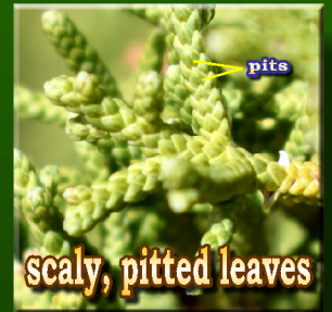
scaly, pitted leaves