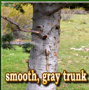
smooth, gray trunk