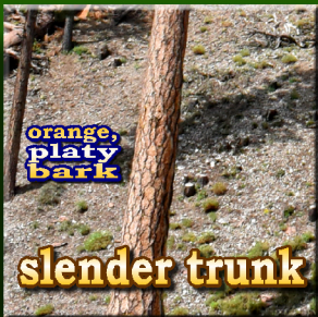
orange, platy bark