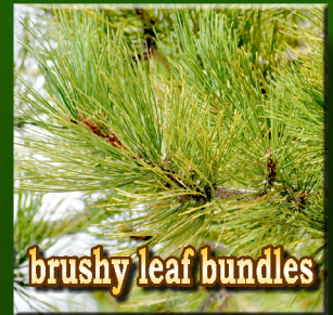
brushy leaf bundles