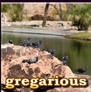
Angel Park GC; Las Vegas,