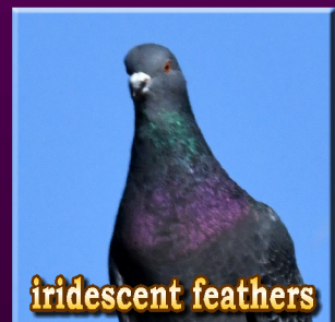
Floyd Lamb SP; LV, NV