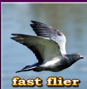
Angel Park GC; Las Vegas, NV