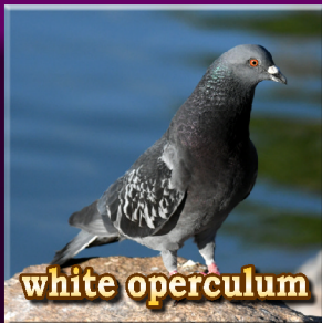
Lorenzi Park; Las Vegas, NV

Introduced from Europe, "pigeons" escaped from domestication to become one of the most common and recognizable of all birds throughout the Americas. I would venture to say that everyone knows this bird--despite the many plumage variations and colors--but relatively few know that it is actually a dove.