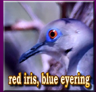
Bosque del Apache NWR; NM