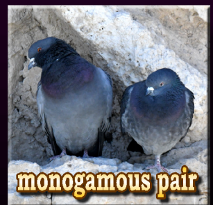
Floyd Lamb SP; LV, NV