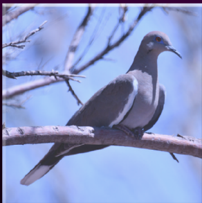
Bosque del Apache NWR; NM