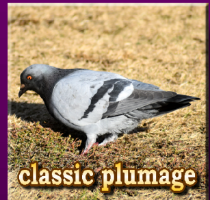
Las Vegas, Nevada