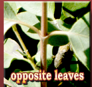
Red Rock Cyn NCA; NV