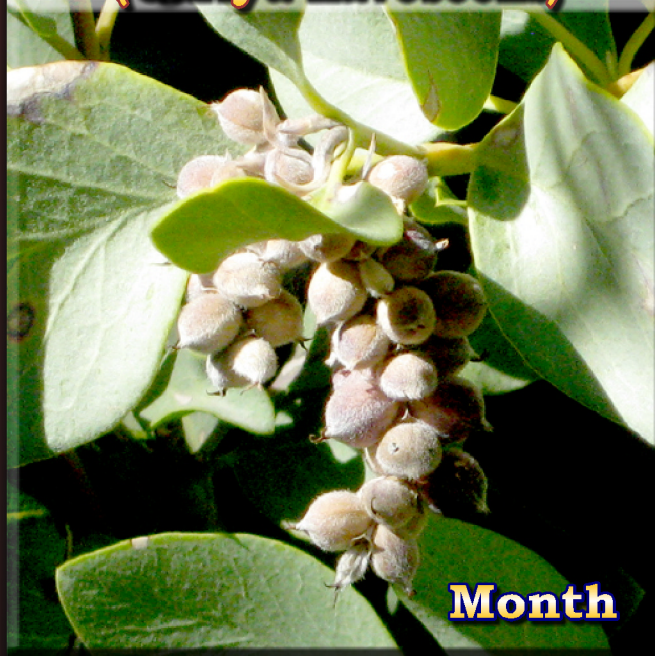
Willow Spring; Red Rock Canyon NCA; NV