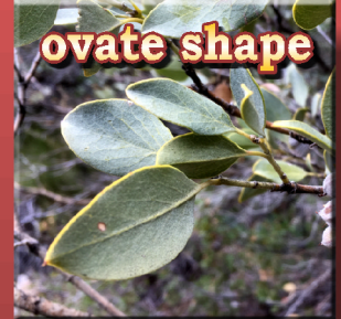
Red Rock Cyn NCA; NV