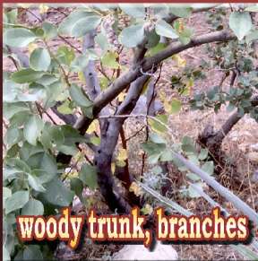
Red Rock Cyn NCA; NV