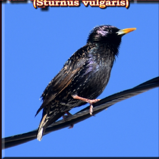
Las Vegas, NV