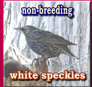
Las Vegas, NV