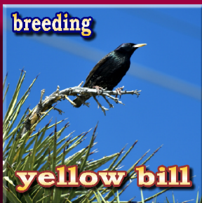
Dolan Springs, AZ