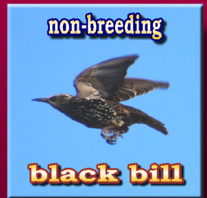
Las Vegas, NV