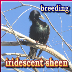
Las Vegas, NV