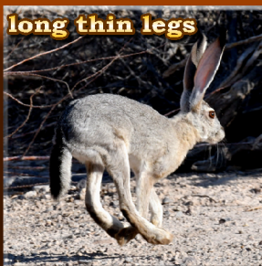
Clark Co. Wetlands Park; NV