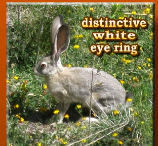
Horse Thief Spg; Kingston Mtn; CA