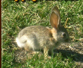
Horse Thief Spg; Kingston Mtn; CA