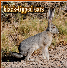
Clark Co. Wetlands Park; NV

Jackrabbits are easily distinguished from their rabbit cousins by their very long ears (left) and hind legs (right), as displayed by this one frolicking along at the Red Rock Canyon National Conservation Area near Las Vegas, NV.