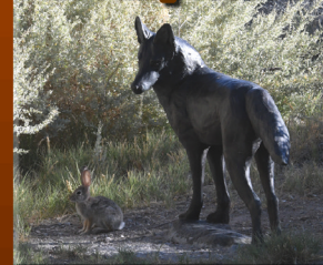
Corn Creek; Desert NWR; NV