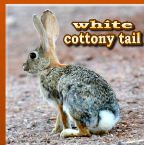
Clark County Wetlands Pk; NV