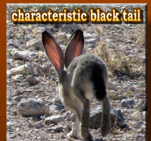
Red Rock NCA; Nevada