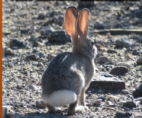
Red Rock NCA; Nevada