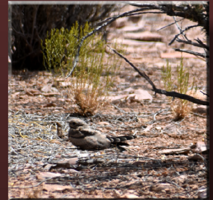
Hualapai Plateau; AZ