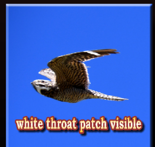
white throat patch visible