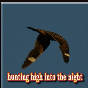
hunting high into the night