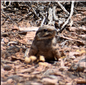
Hualapai Plateau; AZ