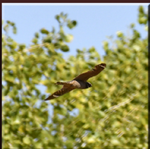
Overton WMA; Overton, NV