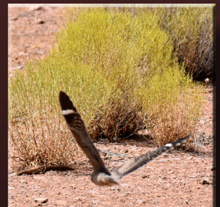
Hualapai Plateau; AZ