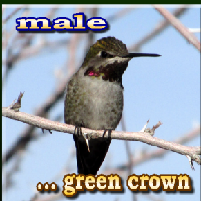
Red Rock NCA; Nevada

Mojave presence: summer range; restricted to far eastern areas