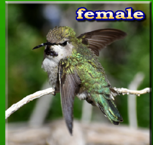
Hoover Dam; Lake Mead NRA