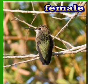
Corn Crk; Desert NWR; NV