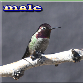
Red Rock NCA; Nevada