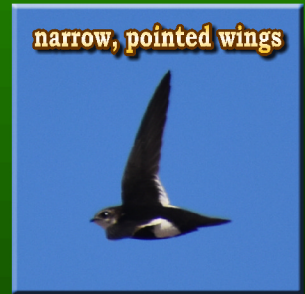
Hoover Dam; Lk Mead NRA