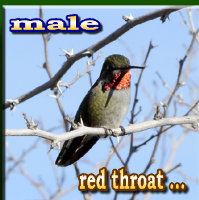
Red Rock NCA; Nevada