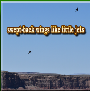
Hualapai Plateau; Grand Cyn