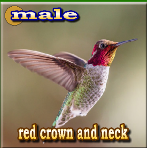
red crown and neck