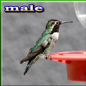
Red Rock NCA; Nevada