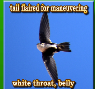
Hoover Dam; Lk Mead NRA