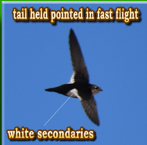
Hoover Dam; Lk Mead NRA