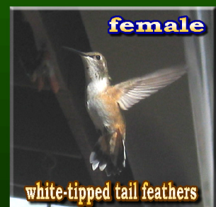
Colorado Plateau; Valle, AZ