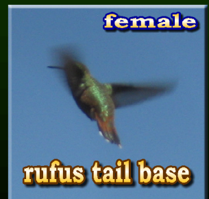
Colorado Plateau; Valle, AZ